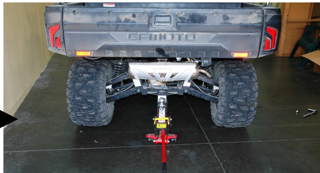
Jack up your UTV

Raise the vehicle so the tires are almost off the ground. Loosen the lug nuts. Then raise the vehicle completely off the ground. Finish removing the lug nuts and then the wheel.