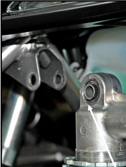
Remove upper shock mount bolt.

1) Raise the front end of the quad so the front wheels are off the ground.