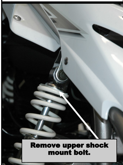
Front right side shock mount.

Facing the front, this is the right side.