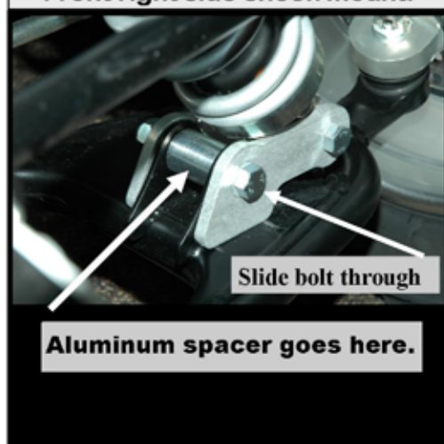
Front right side shock mount.

3) Start your installation with the placement of the aluminum spacer in the shock bracket on the A-arm. Place the two lowering kit plates on the outside of the shock bracket with the taper against the weld. Put a washer on the bolt and run your bolt through. Put a washer on the bolt and put your nut on hand tight. 4) Align the shock on the lower mounting holes and put your bolt through the holes. Put on a washer and then the nut. Now tighten both nuts on the upper and lower part of the lowering kit. Torque to 40 ft. lbs., plus or minus 3 lbs. 5) Repeat the same process on the other side.