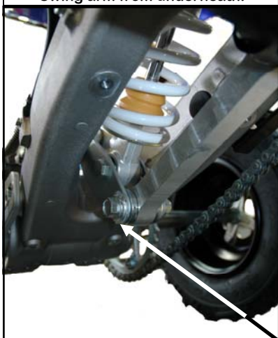
Remove lower shock mount bolt.

2) Locate original rear strut, and undo bolt near bottom zerk fitting. The bushings and bearing should remain on the strut. Do the same with the upper bolt.