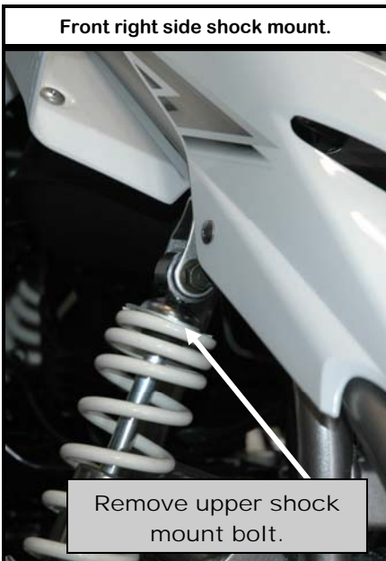
Front right side shock mount.

Facing the front, this is the right side.