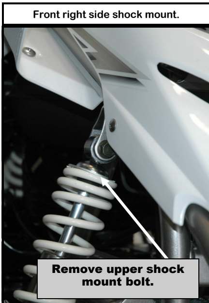
Front right side shock mount.

Facing the front, this is the right side.